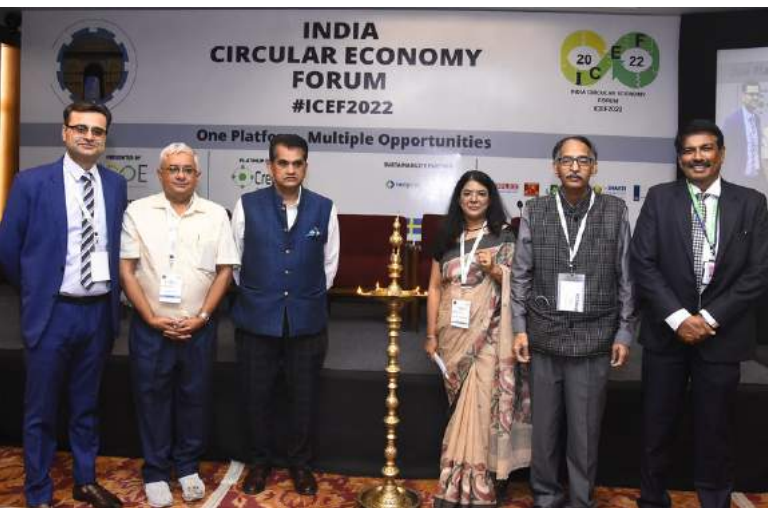
Mr. Amitabh Kant, CEO, Niti Aayog, inaugurated #ICEF2022 with his enlightening speech

The first edition of ICEF in 2022 saw thought leaders, industry experts and practitioners who drove the ambition and action plan for transitioning from a take-make-waste paradigm to a truly circular economy. The recommendation helped to drive sustainable development and to address climatic change. The forum was recognized as India's largest congregation on Circular Economy that focusses on India with a global outlook.