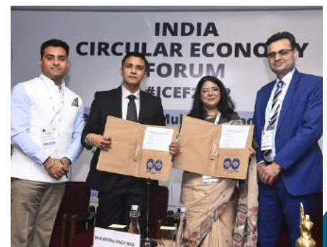
Signing of #MoU with CREDUCE to introduce and promote C-Credit market in #India