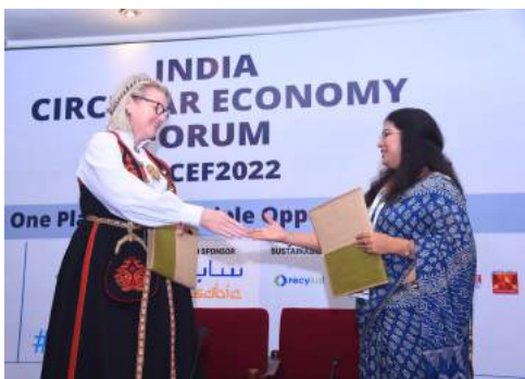
Signing of #MoU with Circular Regions, #Norway to strengthening #multilateral relations and #knowledge sharing between the #GlobalNorth and #South by bridging bottom-up and top-down #circularity