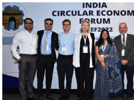
Our international partners at #ICEF2022 EEB, Brussels Circular Regions, Norway CITEO, France