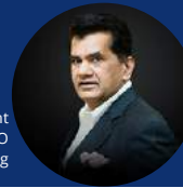
Shri Amitabh Kant CEO NITI Aayog

Plenary : 9:30 am - 10:30 am Guest of HONOR Collaborative Leadership for Bold Action