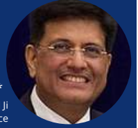
** Shri Piyush Goyal Ji Minister of Industry and Commerce

Opening Plenary : 9:15 am - 9:30 am Chief Guest address